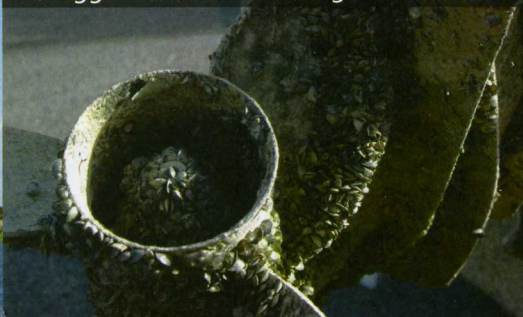
Quagga Mussels encrusting a boat motor

Zebra and quagga mussels are a nuisance for anglers and boaters. They can ruin your equipment, clog cooling systems in motorboats, foul hulls and jam the centerboard wells under sailboats.